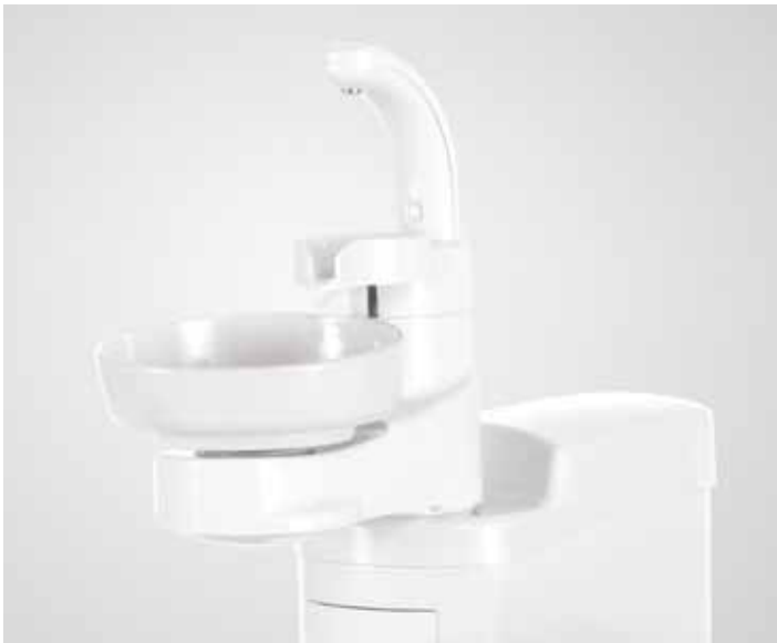
Ambidextrous cuspidor with rotating and detachable porcelain spittoon bowl