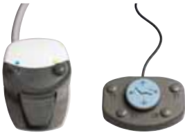
Foot control for instruments and chair

Control all chair movements by hand or foot: by hand from both the Operator's and Assistant's console or by using the foot-control. Spittoon functions and ON/OFF light control 1 are also activated from both the Operator's and Assistant's console.