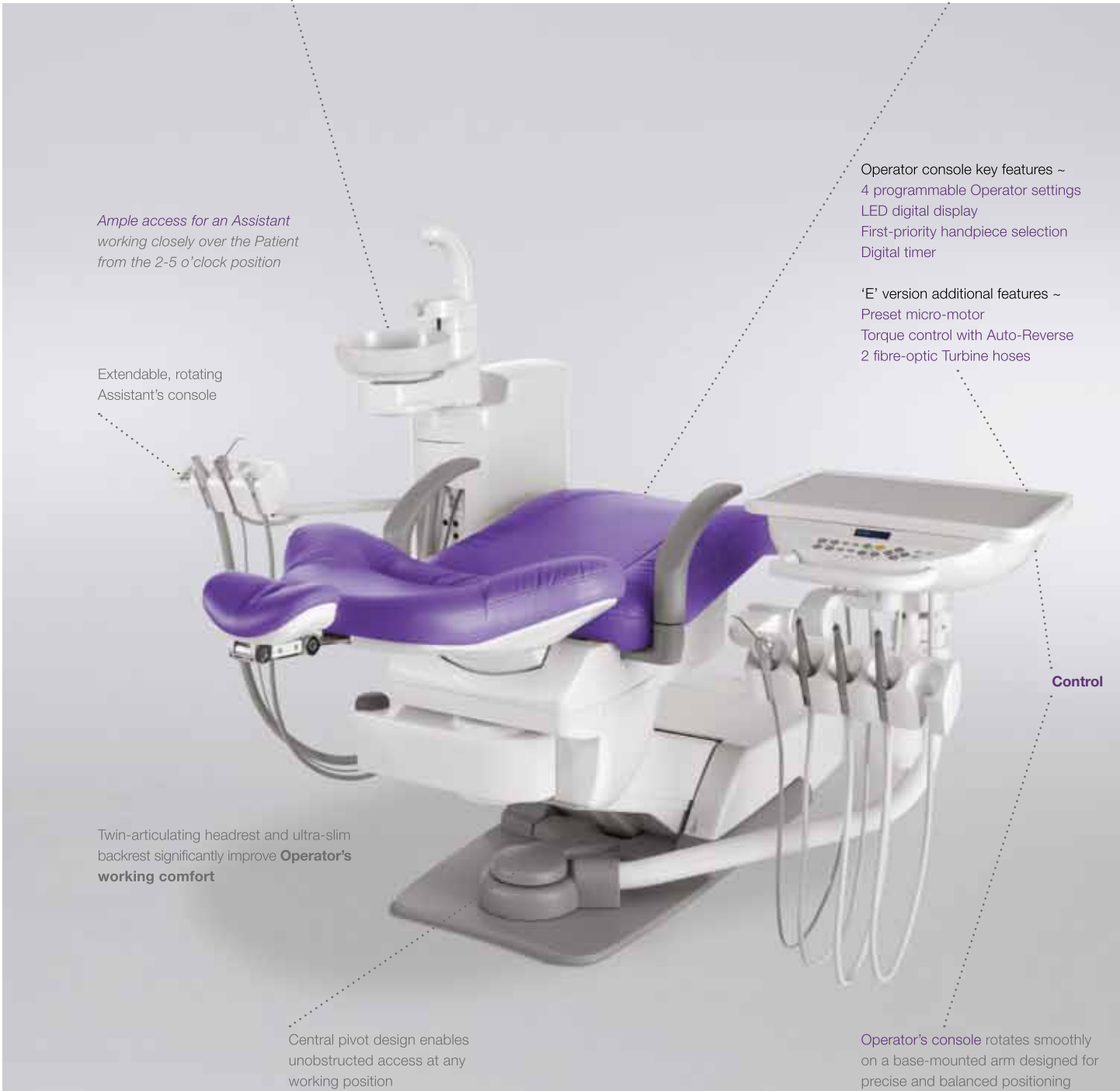
Luxury upholstery (Special order item)

Control and discretion are the finest traits of the Compass delivery system. An intelligent delivery solution which seeks to conceal the instruments from Patient-view without comprising working comfort. Designed for uninterrupted dentistry in the most demanding surgery environments, Compass is pointing to the future.