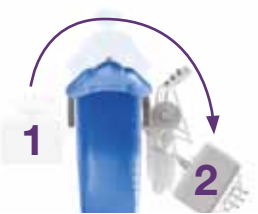
Incline chair. 1-2. Swing table round to left side.