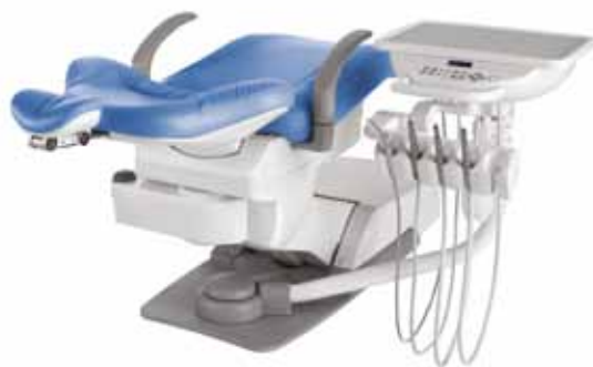
COMPASS 'Flexible Dr System' (Ambidextrous) chair and Operator's console