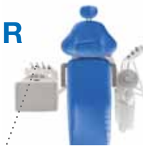
Right-handed set up. Raise chair height and remove the rear cover.