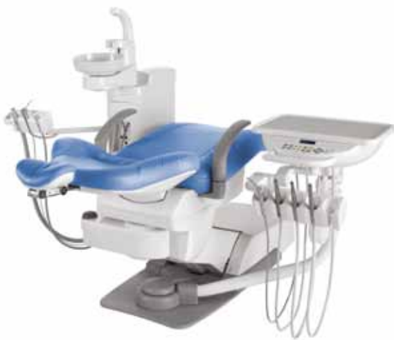
COMPASS 'Surgery System' (Ambidextrous) Air or Electric version