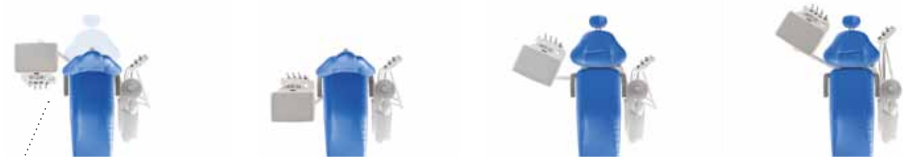
Base-mounted swing-arm delivery system provides the full range of Operator access

To improve efficiency and increase workflow are the key aims of the Compass treatment centre. Sheer mobility enables simultaneous tasks to be carried out, thus saving the Patient and surgery time.