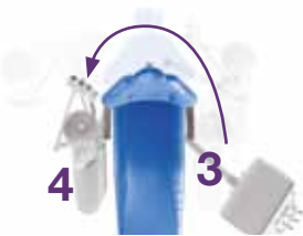
3-4. Swing cuspidor round to right side.